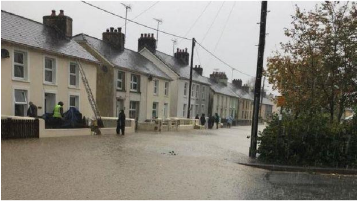
Morning, 13 th October 2018 – beginning of flooding at Station Terrace, Llanbydder