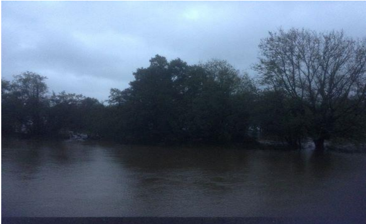
River Teifi from Highmead Terrace, Llanbydder – 13 th October 2018 – all properties in Station Terrace Llanbydder flooded after river broke its banks